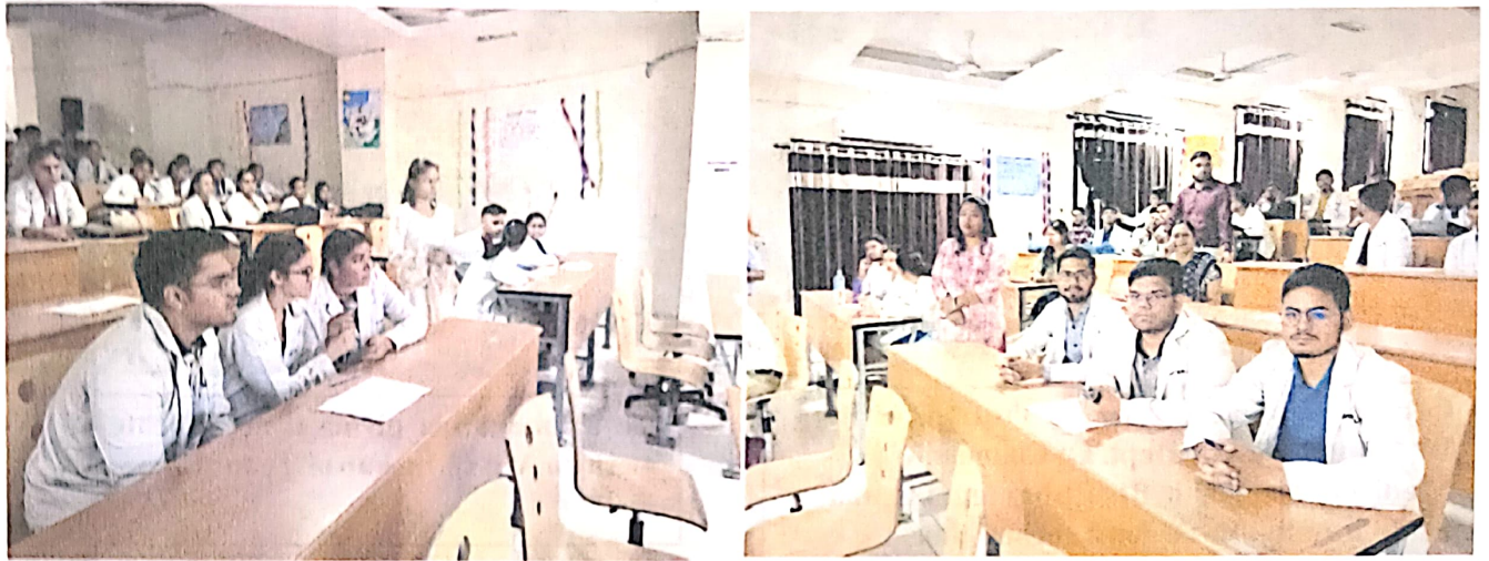
Participants of Team A B C & D