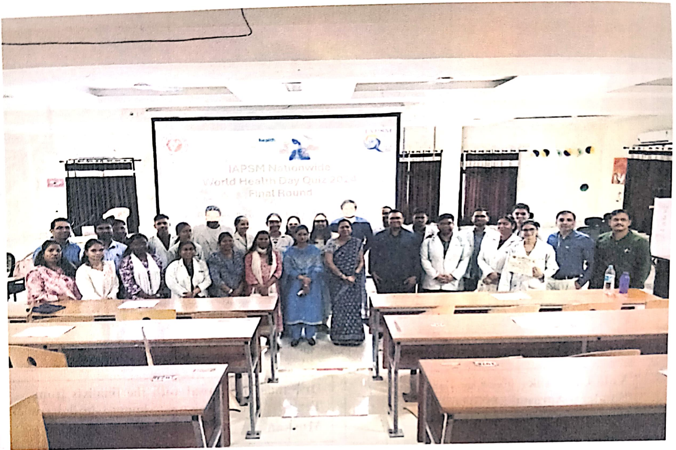
Group photo of Department of Community Medicine with quiz and UG participants